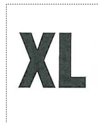
Size label bag