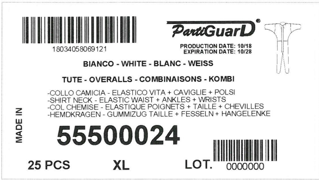
Garment neck size label