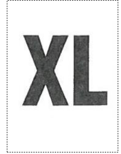
Size label bag