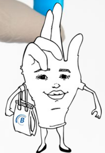
Ms.G.Love™ represents BioClean's range of cleanroom gloves