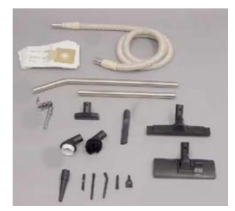
EMI-CWR Tools and Accessories with Disposable Filter Bags - Included